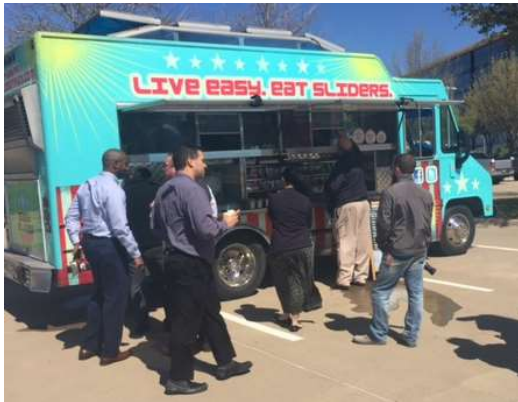
Among other dining options at Hall Park, tenants can grab lunch from multiple vendors at the Food Truck Park.

"HALL Park is redefining the workplace, featuring an amazing art collection, picturesque lake views, and unique amenities, such as our wine lounge, walking trails, and lakeside meeting and event spaces," Hall points out. "I'm excited to see and be a part of the park's future growth plans and look forward to seeing where it will be in 5, 10, and 20 years."