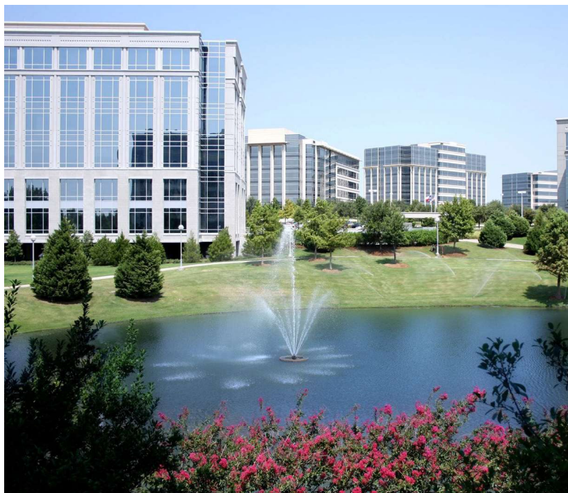
Hall Park tenants enjoy "the park life" – lush landscaping, nine walking trails, outdoor meeting and dining areas, and a world-class collection of modern art.