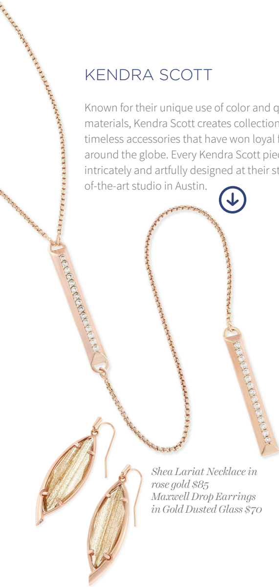
Shea Lariat Necklace in rose gold $85 Maxwell Drop Earrings in Gold Dusted Glass $70

Known for their unique use of color and quality materials, Kendra Scott creates collections of timeless accessories that have won loyal fans around the globe. Every Kendra Scott piece is intricately and artfully designed at their state-of-the-art studio in Austin.