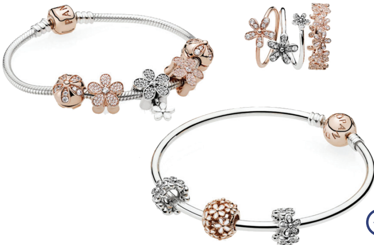
The 2017 Spring Collection by Pandora