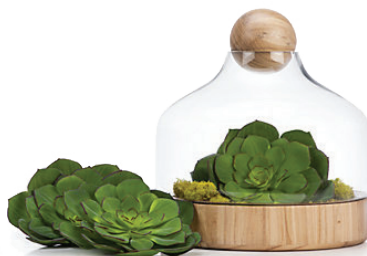
Relaxed: Large Echeveria Pick $38 for Set of 3