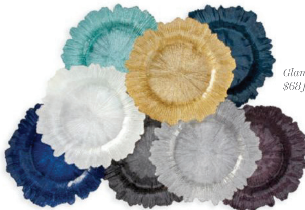
Glamour: Spruzzo Chargers $68 for Set of 4