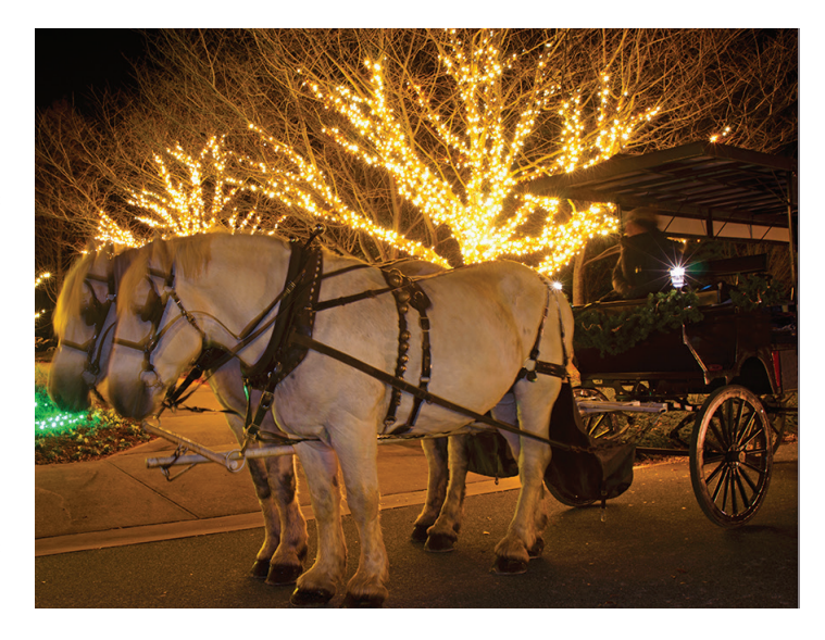
FREE HORSE-DRAWN CARRIAGE RIDES from 4 to 8 p.m. on Nov. 19, from 6 to 9 p.m. on Nov. 25 and 26, Dec. 2-3, 9-10, 12-17, 19-23. What could be more charming than a cozy, horse-drawn carriage ride on a crisp winter evening? Bring the family or that someone special for a horse-drawn carriage ride around Watters Creek. Carriages hold up to six passengers. Rides are free and on a first-come, first-served basis. Pick-up located by DSW. Weather permitting.

Looking for a free, family-friendly event to kick off your holidays? Watch Watters Creek transform into Allen's Winter Wonderland, decked out for the season with caroling, carriage rides, crafts, and Santa! Don't miss the dazzling interactive light show at 6:15 p.m. - a mesmerizing feast for the eyes and ears, with 145,000 glittering tree lights synchronized to favorite holiday tunes. And did we mention spectacular fireworks to cap off the night?