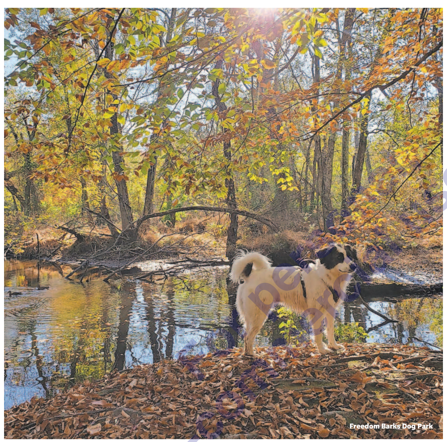
FREEDOM BARKS DOG PARK

love the Discovery Barnyard and Animal Farm, which includes multiple play areas with go-kart tracks, lawn games, a giant sandpit and three splash pads. Little ones can also feed the farm's chickens, cows, donkey, goats and sheep.